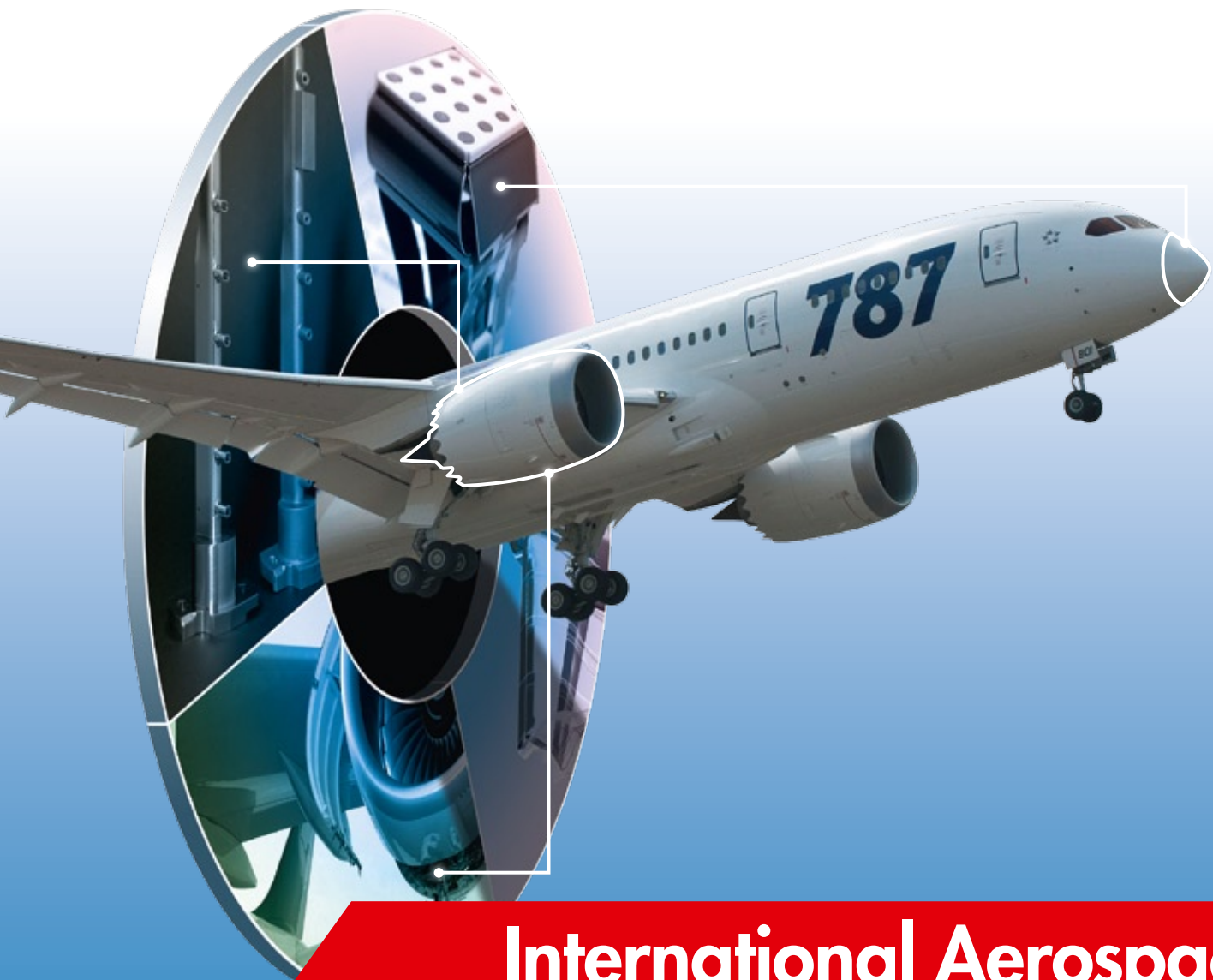
Exhibit at AIRTEC 2012

International Aerospace Supply Fair & B2B Meetings