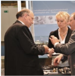
Exhibit at AIRTEC 2012 and look forward

AIRTEC 2012 The premium business and technology event where suppliers and key executives of manufactures involved in the aerospace supply chain come together from around the world.